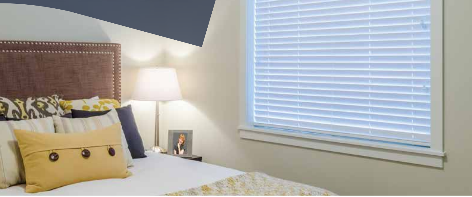
WINDOWARE VENETIAN BLIND