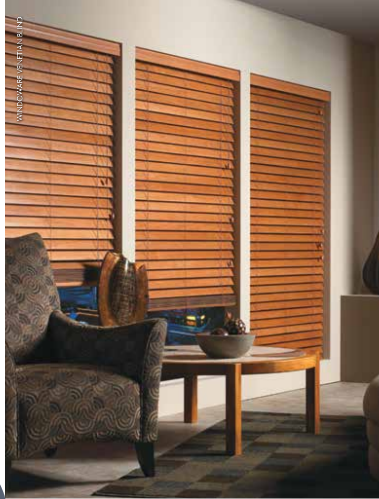
WINDOWARE VENETIAN BLIND